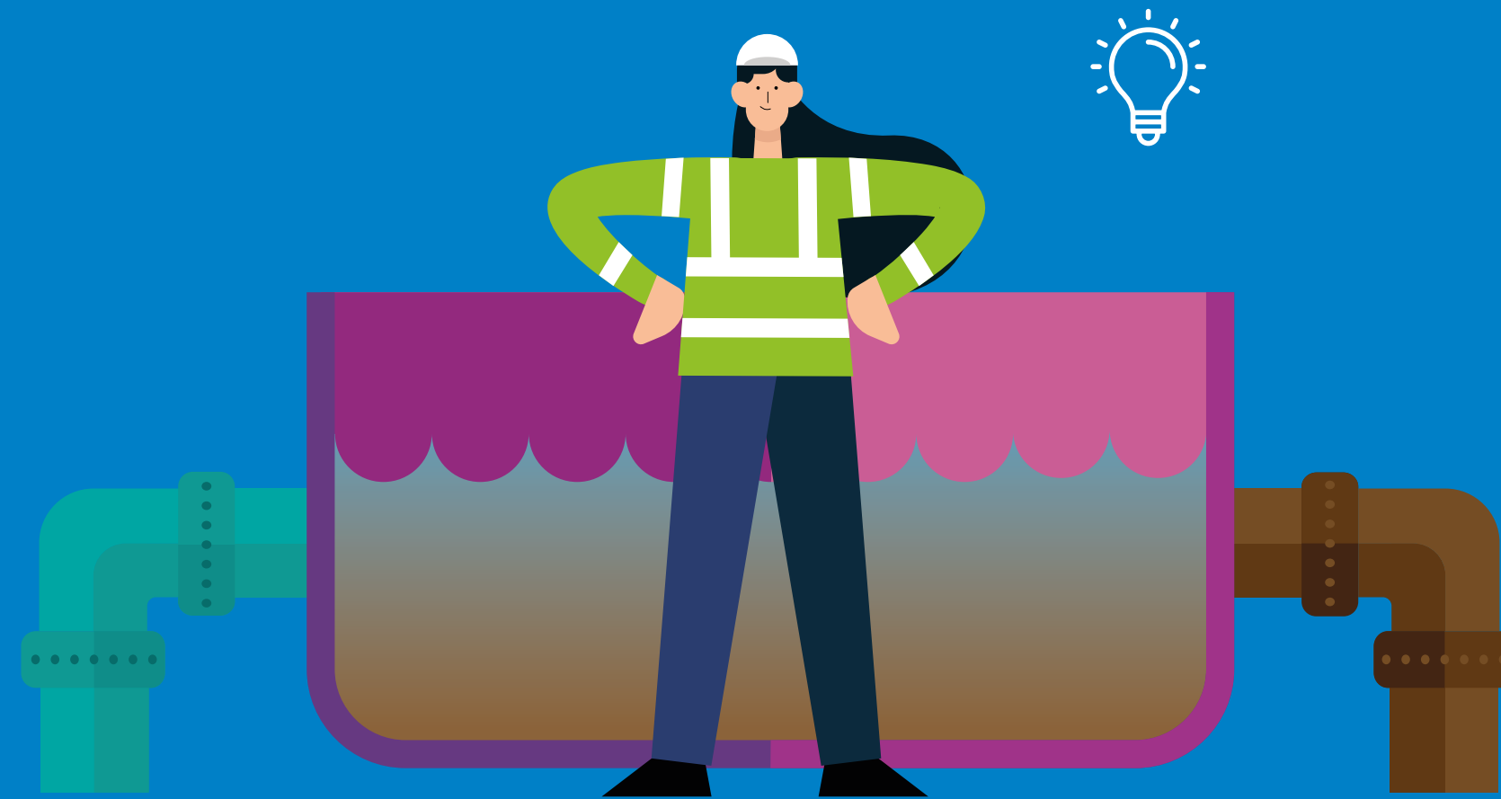
Wastewater Treatment Works