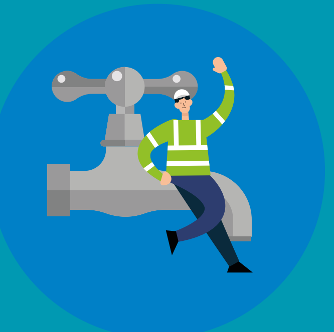
Operations and maintenance