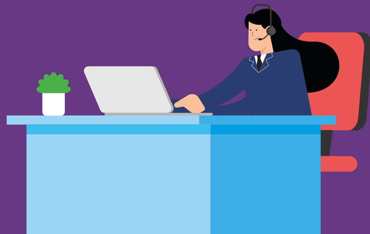
Customer Service Team