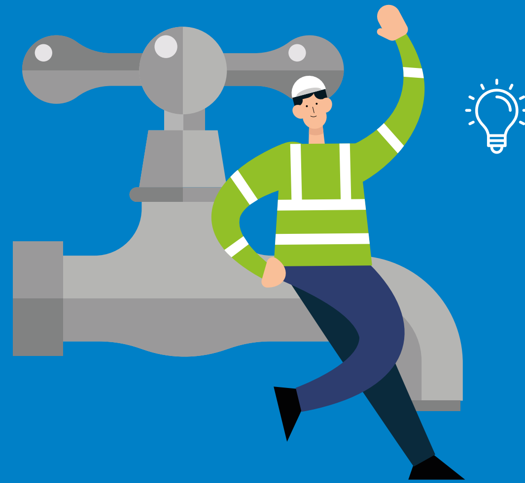
Water Treatment Works