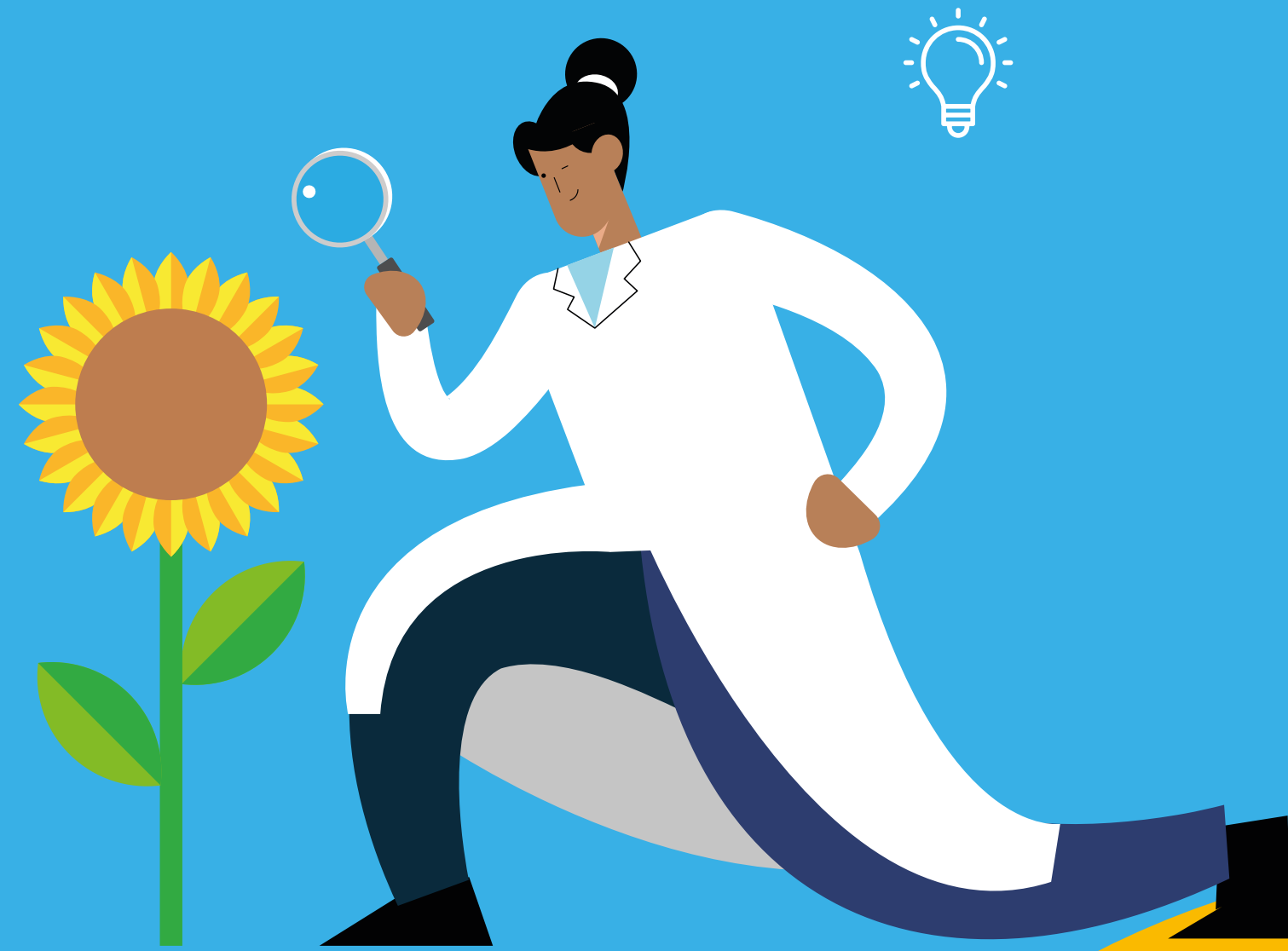
SCAMP* Scientists *(Sustainable Catchment Area Management Practice)