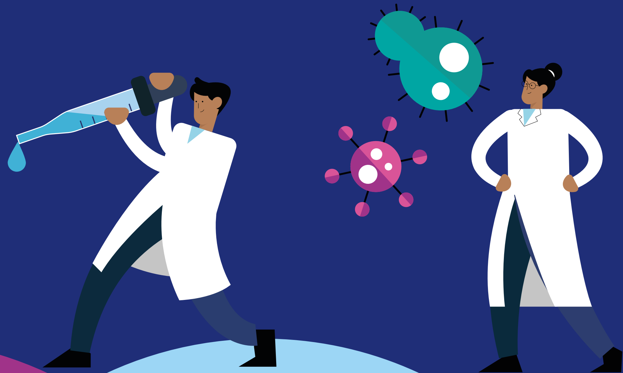
Clean Water Scientist