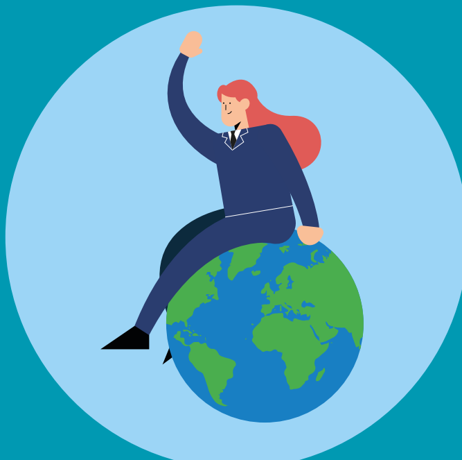
Geographic Information System Specialist