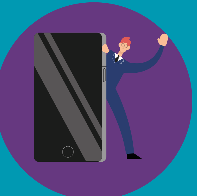
Communications and Education