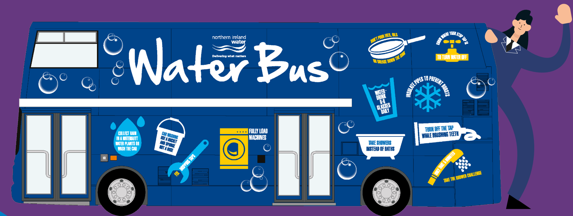
The NI Water Education Team