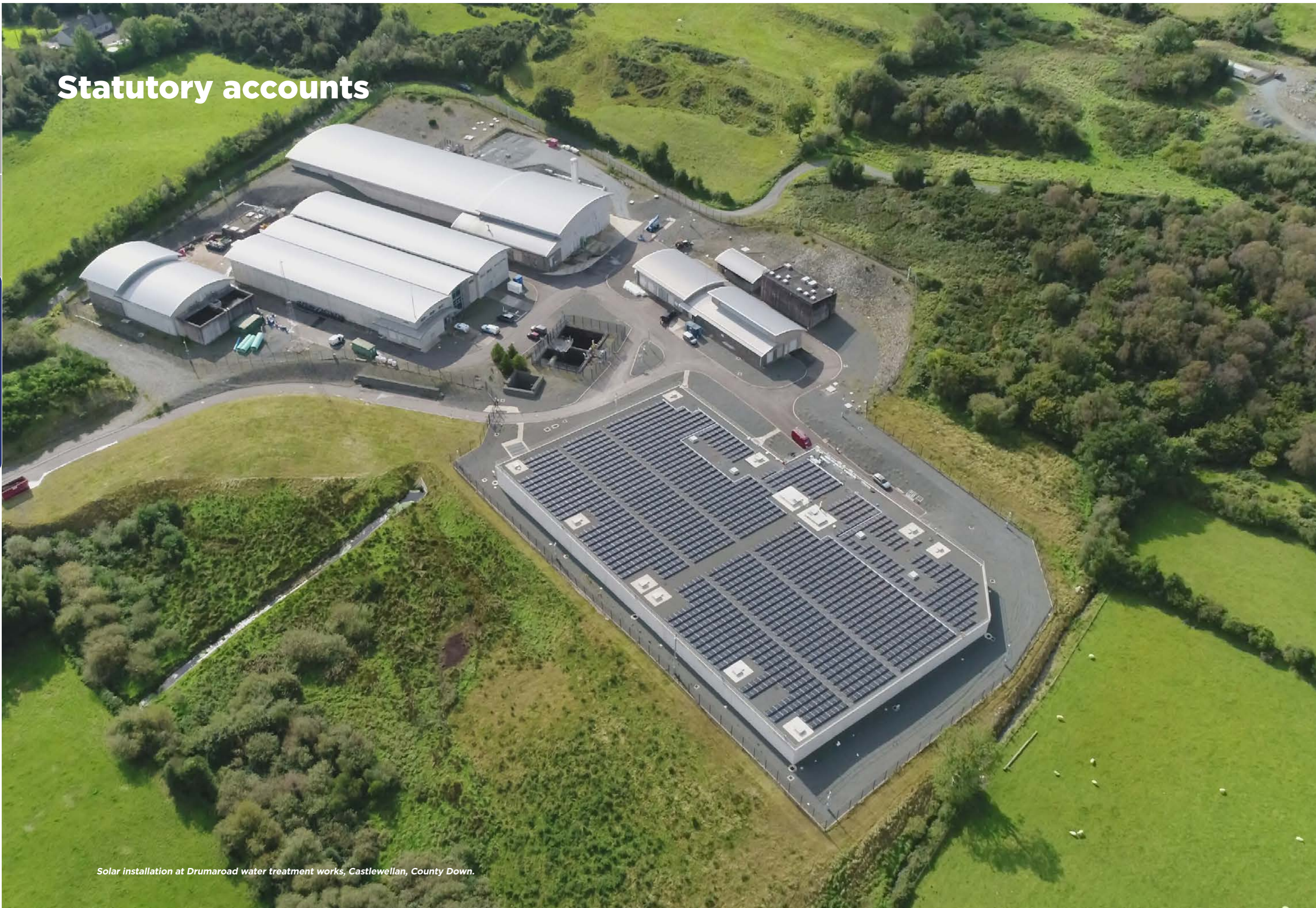
Solar installation at Drumaroad water treatment works, Castlewellan, County Down.